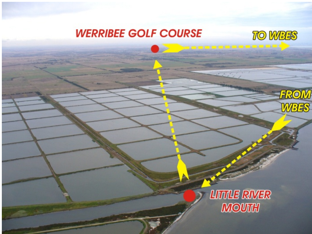
Above: At LRM, looking northeast towards the Werribee Golf Course.