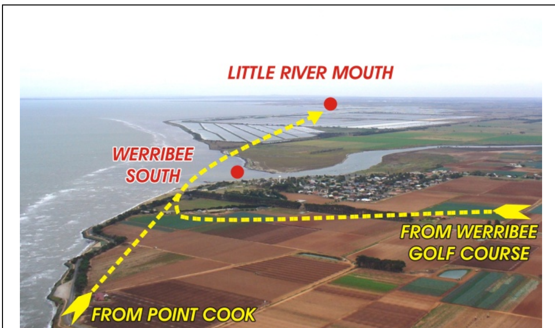
Above: Approaching Werribee South, looking southwest towards LITTLE RIVER MOUTH (LRM). Mouth of the Werribee River in the centre, LRM in the distance.