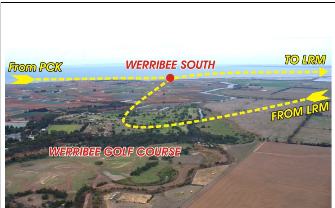
Above: Just west of Werribee Golf Course, looking east towards Werribee South.