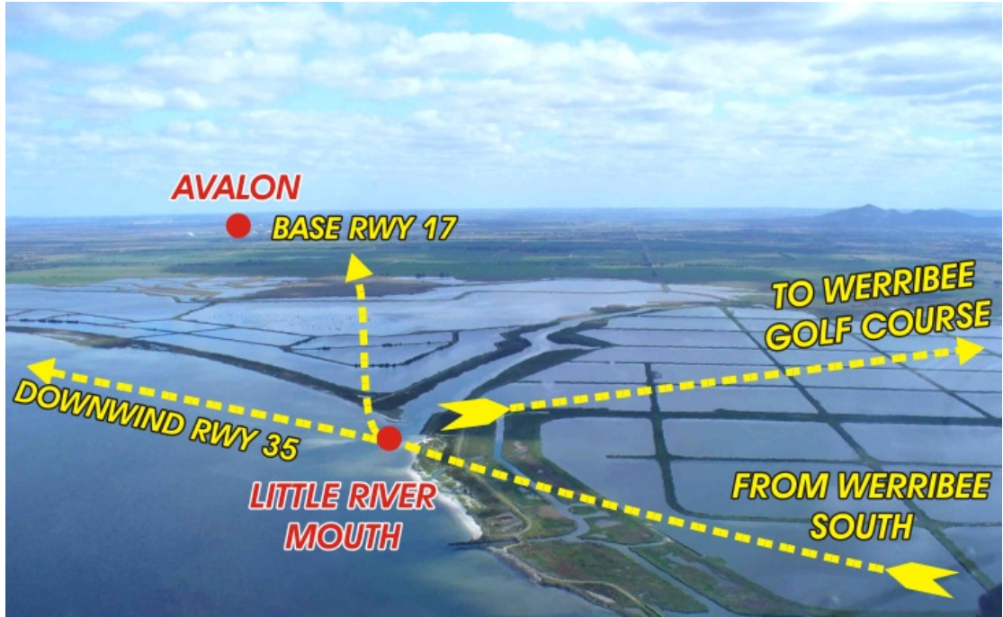
Above: At LRM looking southwest towards Avalon East.