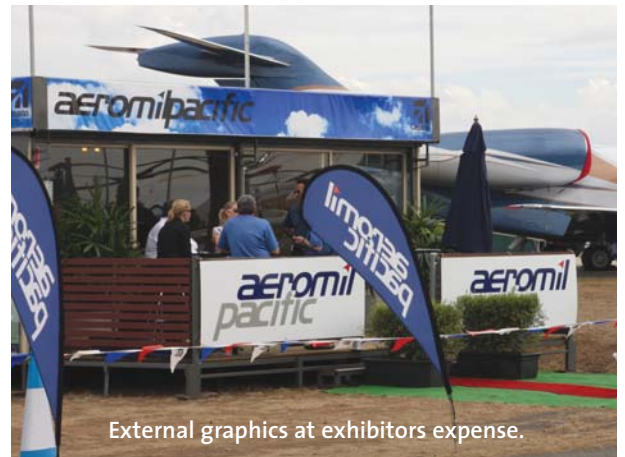
External graphics at exhibitors expense.